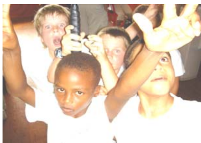
The Somersfield kids chasing the cameraman...

Home School beat Elliott Primary 17 - 12