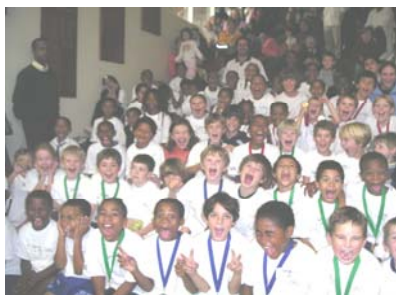
Full house for the final